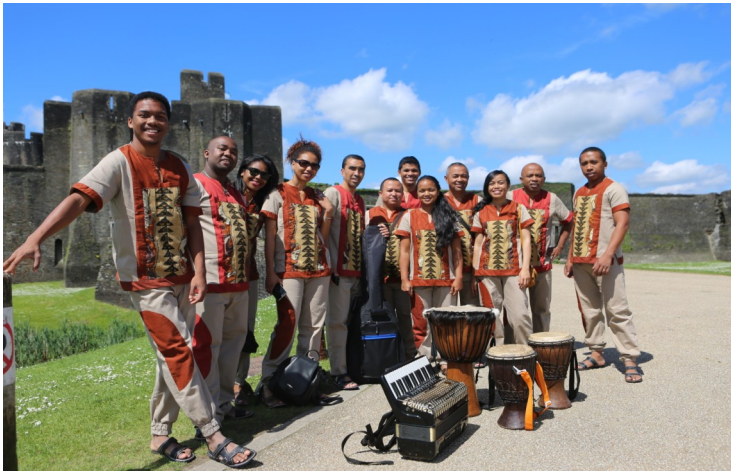
Ny Ako were part of the celebrations in Aberaeron