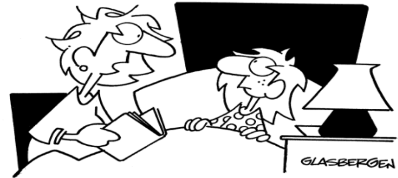
"Yes, the disciples followed Jesus... but not on Twitter."