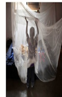
A pack of five mosquito nets