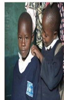
Send a child to school