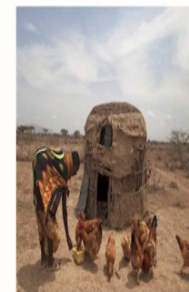
A pair of chickens