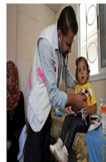
Antibiotics for a mobile clinic