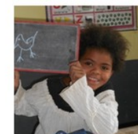
Education for a Bright Future

£10 could buy a Christmas meal and a Christmas present.