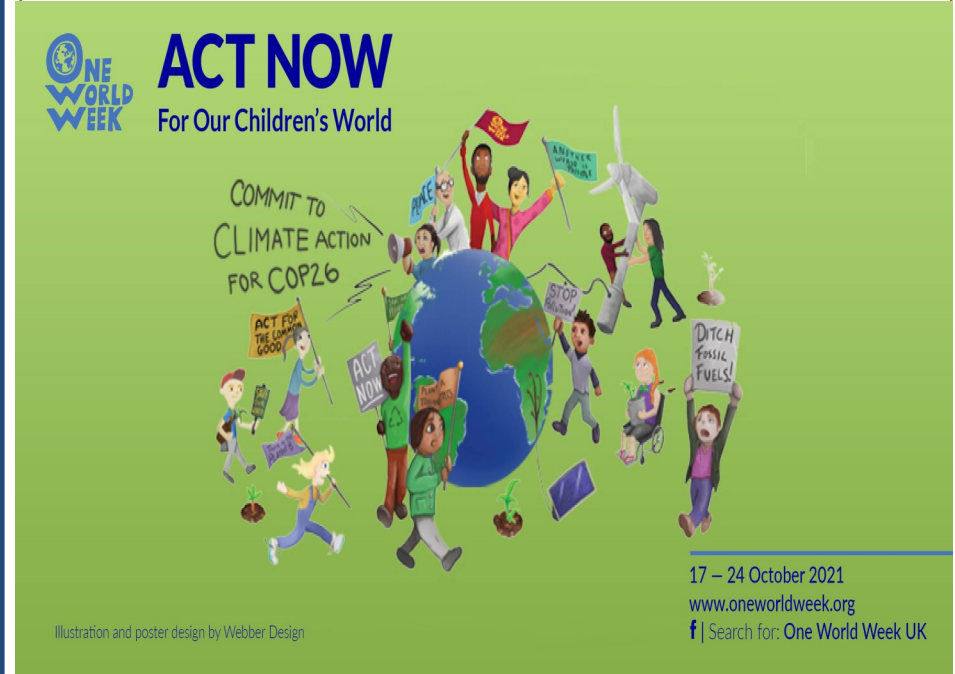
Illustration and poster design by Webber Design

17 – 24 October 2021 www.oneworldweek.org f | Search for: One World Week UK