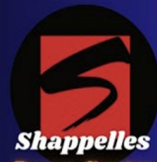
Shappelles Dance Centre